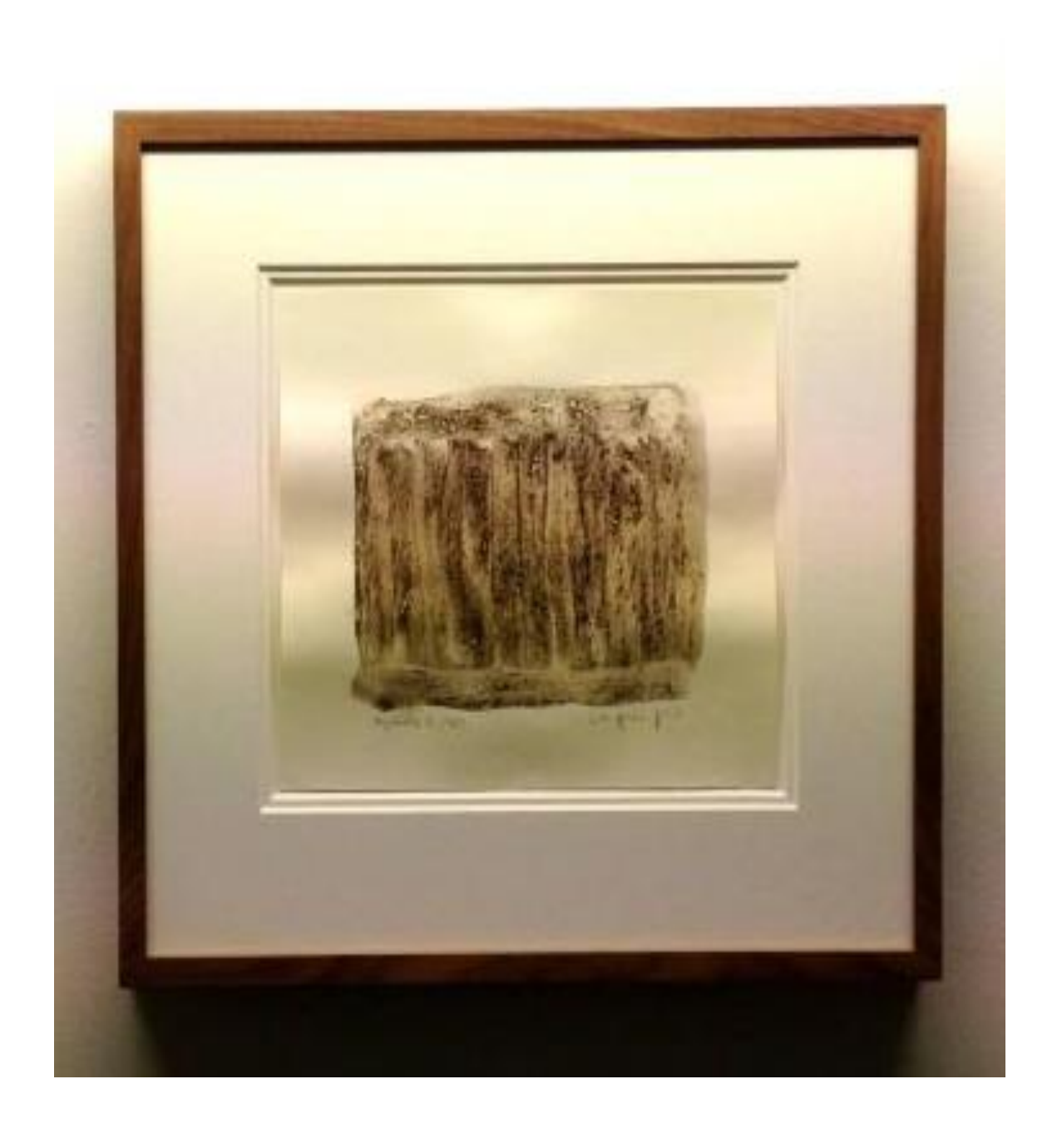
\textbf{Fig.} \textit{7-} \ \textit{One of the "Majdanek (1989) I-IX" in the "Memory Works" Exhibit by Carl Michael von Hausswolff.}