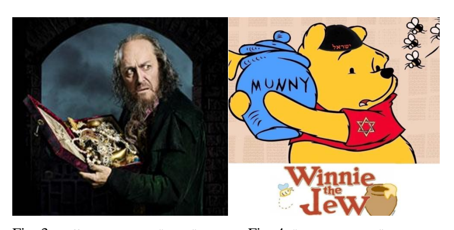
Fig. \ 3\hbox{-} \ \text{Griff Rhys Jones as "Fagin"}.