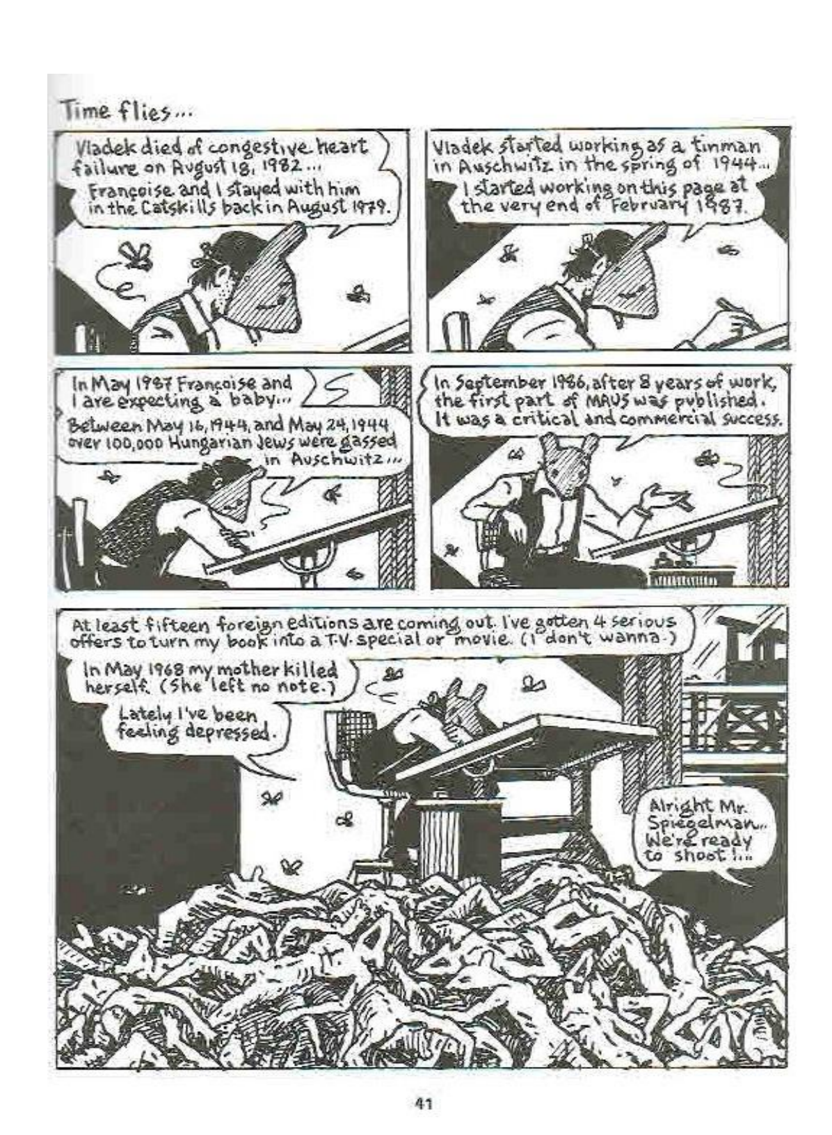
Fig. 6- Art at his drawing board perched on a pile of corpses. It shows the artists awareness and anguish about the success of his work, which is based on the story of the victims of the Holocaust. ( Maus 2:41).