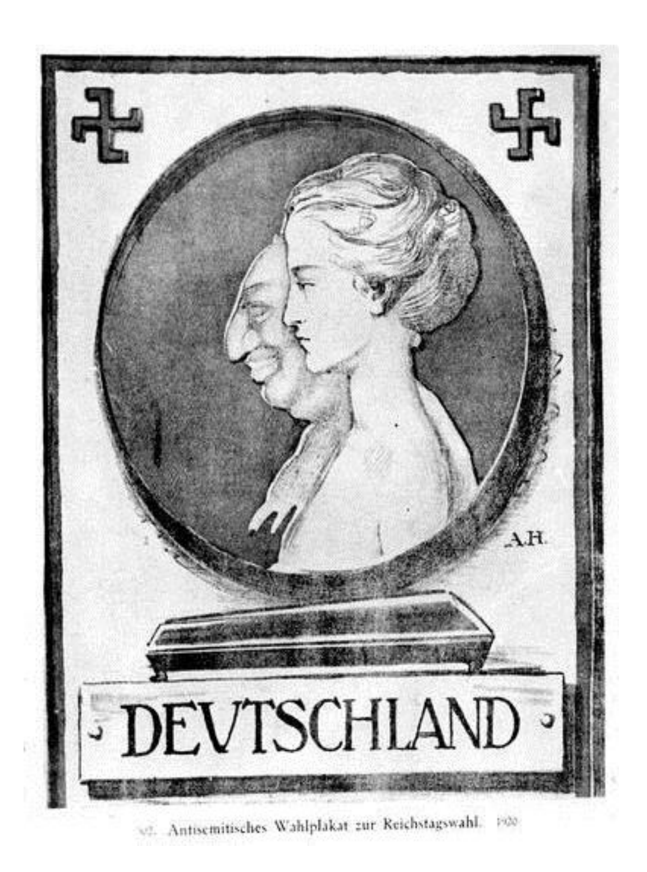
Fig.1- "Deutschland; Antisemitiches Wahlplakat zur Reichstagswahl 1920".